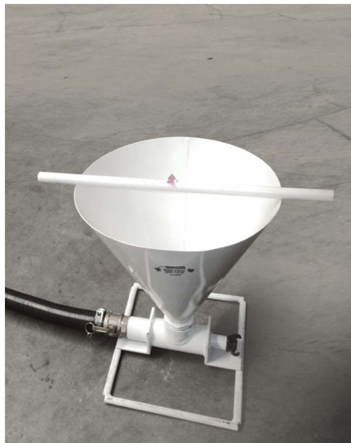
VLI Part Code-ZSDUNIDUST

FRAS Polyurethane cones available as an alternate. All components including spare hoses and fittings are available as spare parts.