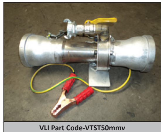
VLI Part Code-VTST50mmv